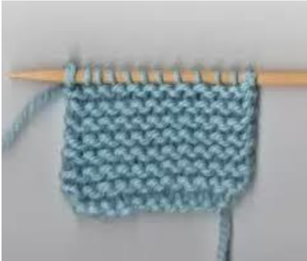
Bumpy Side= Purl

Many students get confused with when they are meant to do a knit or purl row, a clever reminder is that when they have a smooth side in front of them they knit and when it is rough then they purl. They may need reminding of this a few lessons in a row.