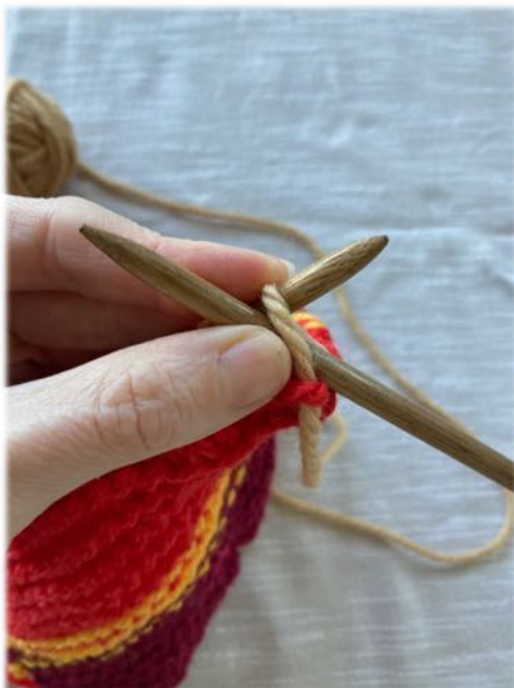
Out of the bunny hole

“Out of the bunny hole Around the front of the oak tree Back into the bunny hole Away runs he/she”