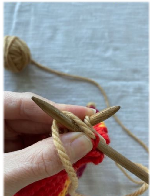
Around the front of the oak tree