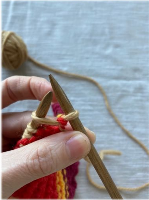
Back into the Bunny hole