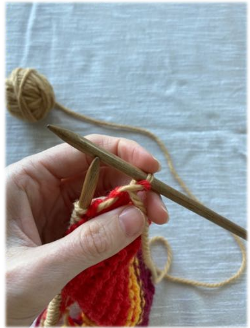
Away runs he/she

Step 3: Now the tricky part is that you will need to do one row purl one row plain. An easy way to remember which row to do when is like so: